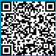
Economics Internship Webpage

Upon approval, register for ECON 487 on RamWeb.