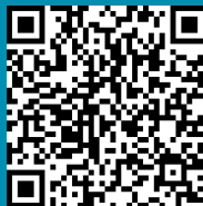
Job/Internship Search Toolkit