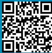
Internships on Handshake