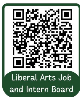
Liberal Arts Job and Intern Board