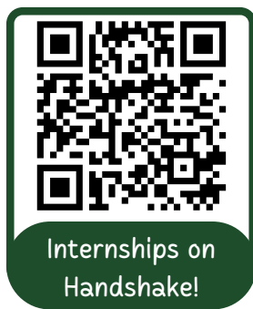
Internships on Handshake!