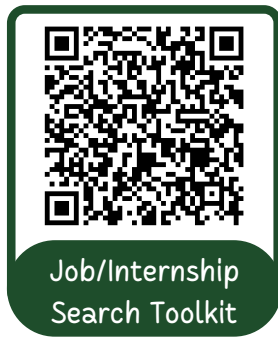
Job/Internship Search Toolkit

9 credits completed in target language; 50% of work tasks must involve target language