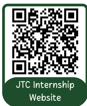
JTC Internship Website