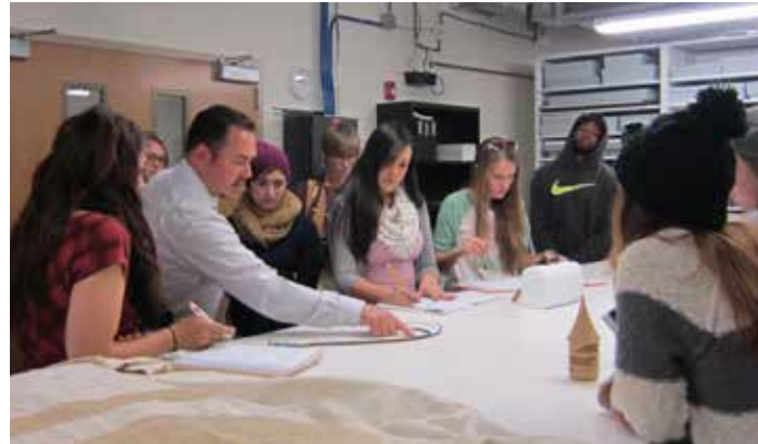
Faculty and students from the seminar Museum Collections: From Storage to Exhibition, working on objects from the permanent african collection.

Gregory Allcar Museum of Art invites individuals to engage with art and each other to inspire fresh perspectives and wonder. The Museum is a catalyst for visual literacy and critical thinking that instills a passion for learning.