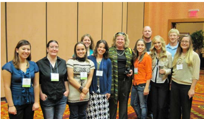
Some of the volunteers who helped make this event one to remember.

Colorado archaeology and CSU archaeologists were front and center during the conference, and the Department of Anthropology is very proud of the tremendous amount of research and scholarship they have produced. In addition to some of the highlights listed below, the conference hosted a poster session for the Department of Anthropology's field schools, providing an opportunity for the Plains archaeology community to become familiar with the training we provide our students and the top-notch research that is the product of student engagement.