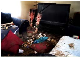
Damage at the trailer park

...with 1 of the 15 non-profit, governmental, or faith-based groups handling recovery for the flooding in Weld County. They then identified follow up questions and returned for a second interview. The sum of these interviews produced a robust dataset—29 interviews with 15 recovery agencies.