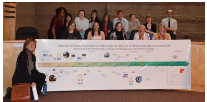
ANTH 532 students present their findings in Evans, Colorado